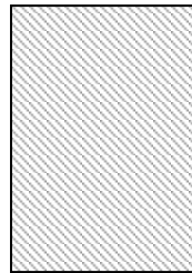
Full Page 7 ½ x 10