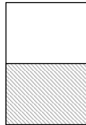
Half Page 7 ½ x 4 ¾